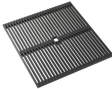
Black Grid 8100 600