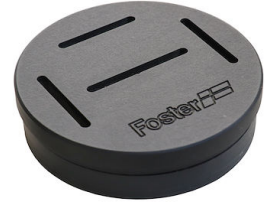
Knives-holder 8100 030