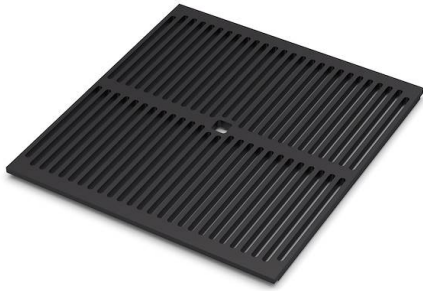
Black grid 8100 617